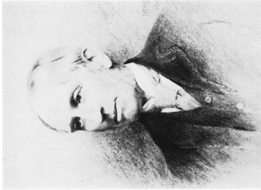
Reproduced by courtesy of the Secretary of State for Commonwealth Affairs Sir Louis Mallet, Permanent Under Secretary of State for India, 1874-83