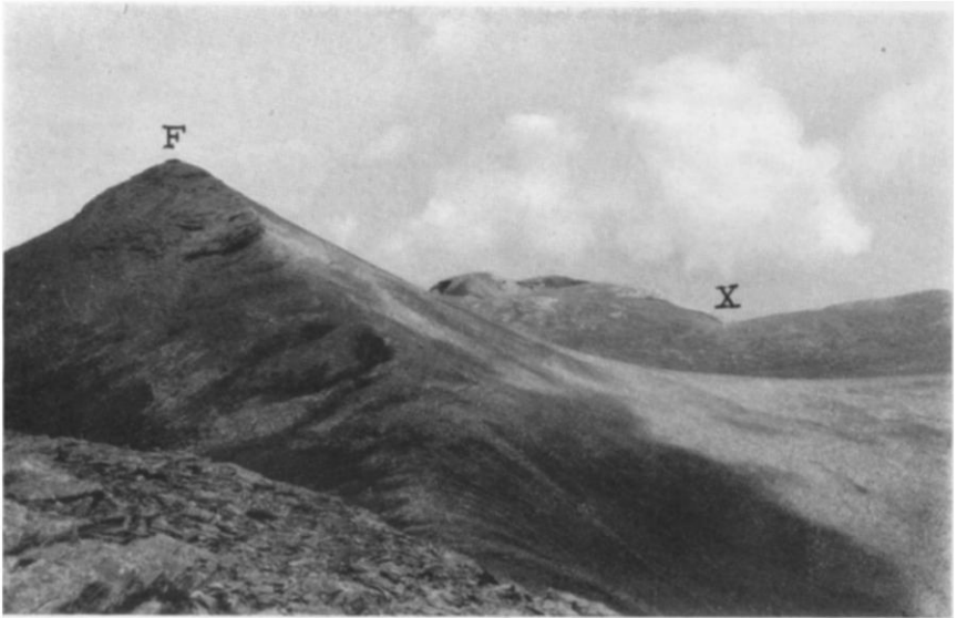
5. SAINT ELIAS, THE PRAIRIE DES DIEUX, AND THE PORTA (X) FROM POINT G