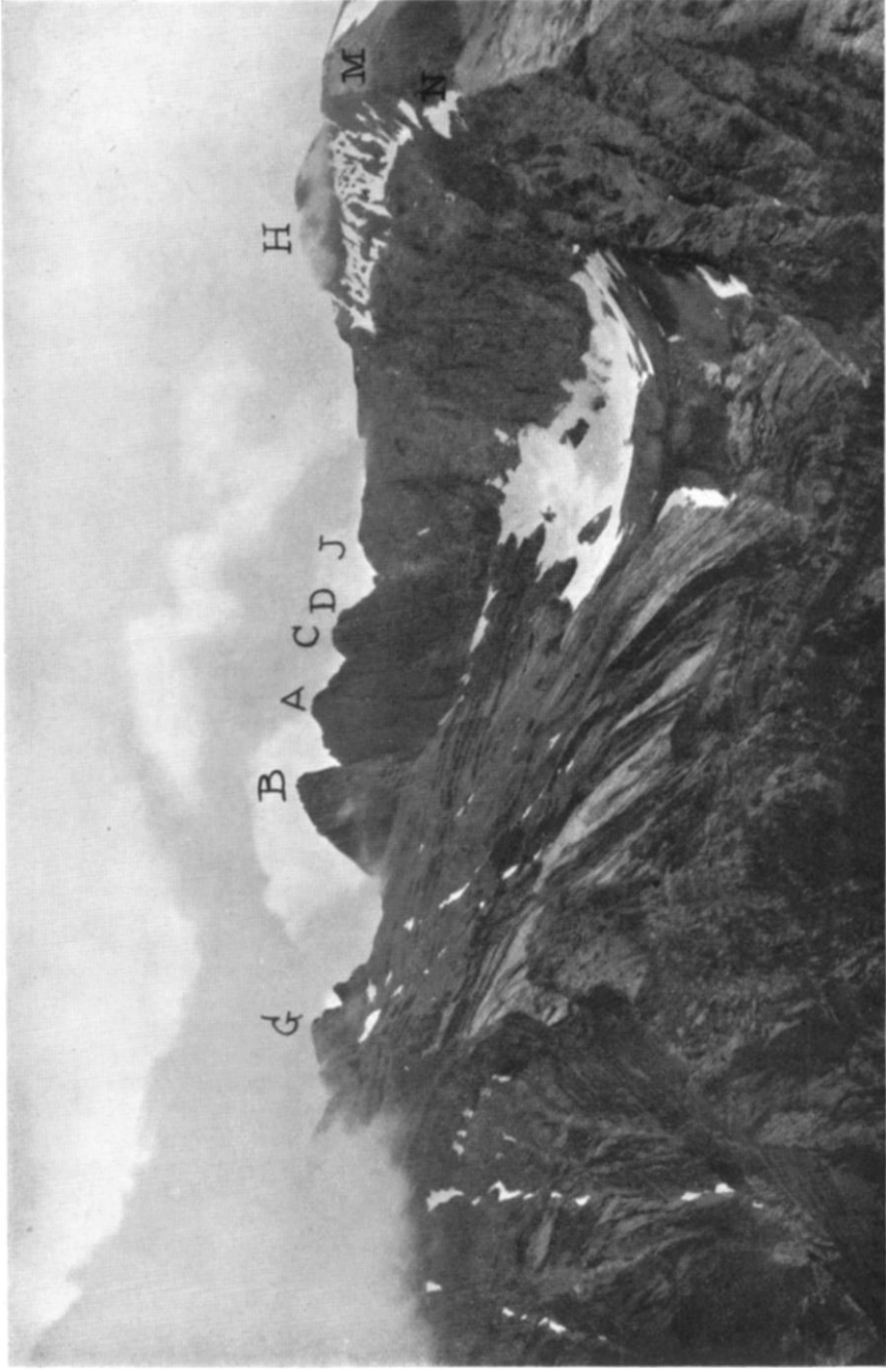
3. THE SUMMITS OF OLYMPUS AND THE TRANI GURNA FROM SALA TULA

G : Pic Jacques Philippe ; H : Skolion ; J : Tête noire. Other points as in Plate 2