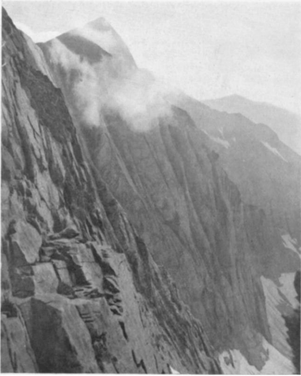
4. SKOLION FROM THE BREACH AT K, PLATE 2